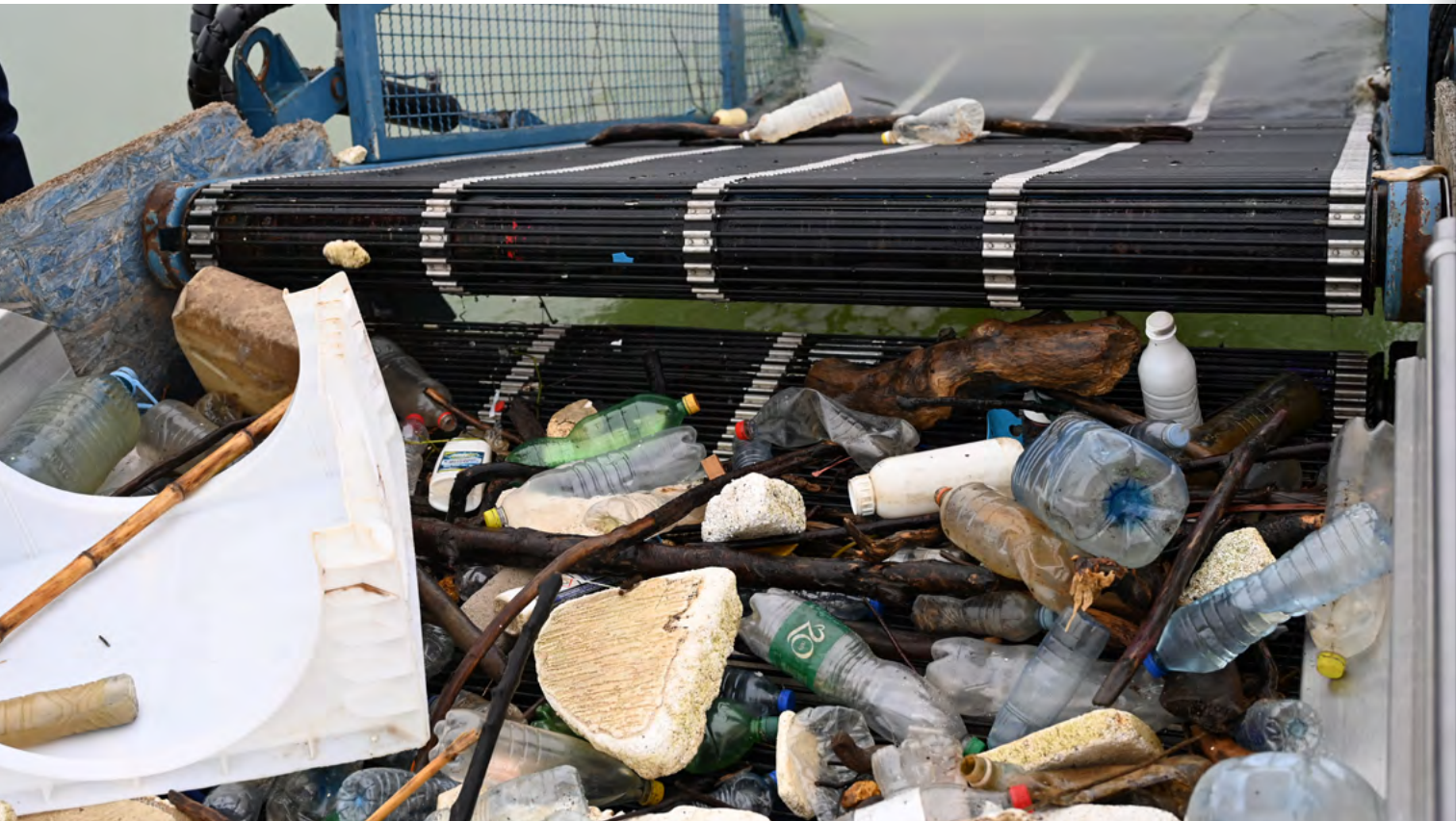
During the process of collecting plastic waste in Fierza/Kukës Lake.