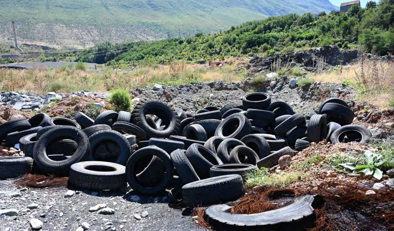
Harmful and inert waste from the former copper plant.