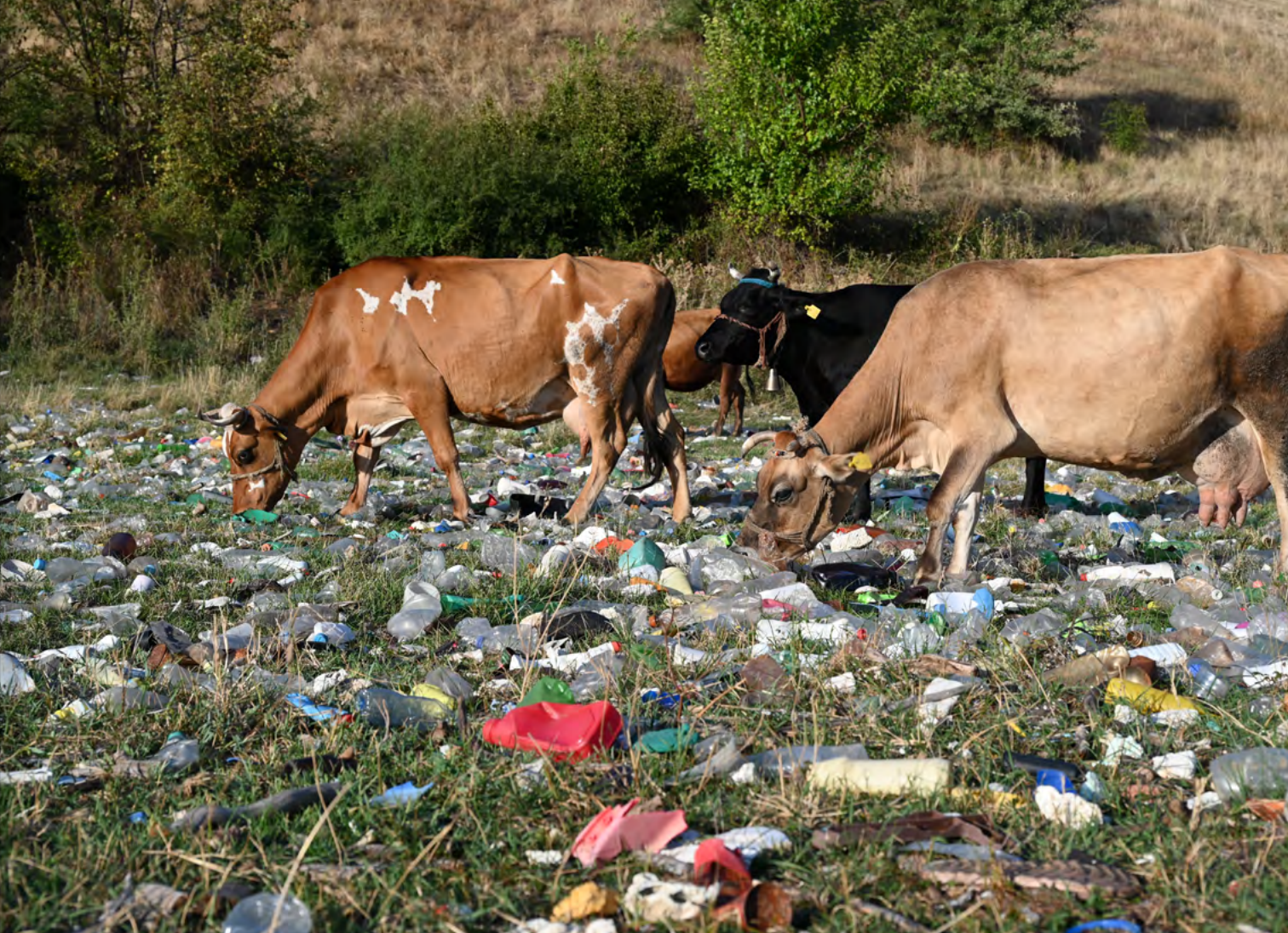
Piles of plastic left behind by the lowering of Fierza Lake in summer. During the summer drawdown, the lakebed turns into pasture for livestock, while in winter the waste floats on the water.