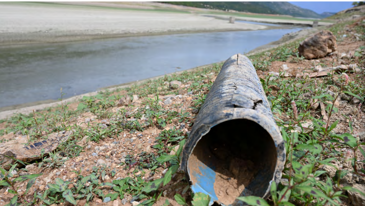
During the summer, the water level of Lake Kukës drops, and the waste gets stuck on the valley slopes. In winter, it is deposited into the lake.