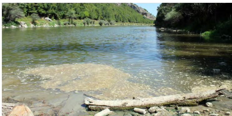
Pollution of the White Drin in the village of Nashec, Prizren

“The massive problem of waste in rivers and streams appears to result in pollutants in surface waters; for example, organophosphates, specifically associated with plastic products (bottles), were measured throughout the water bodies,” the report states.