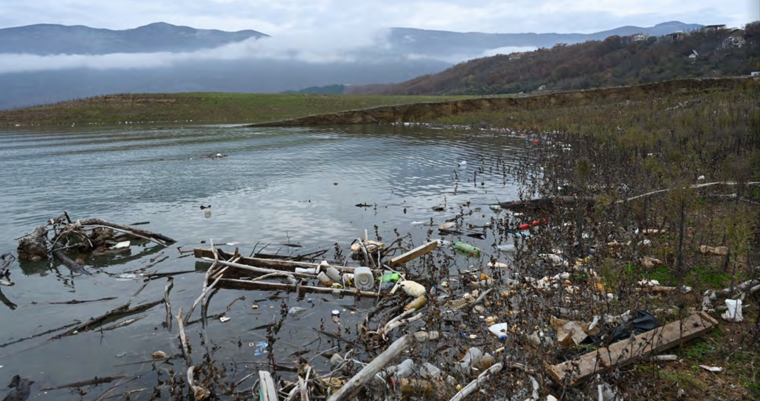
Waste stuck on the shore of Fierza/Kukës Lake.