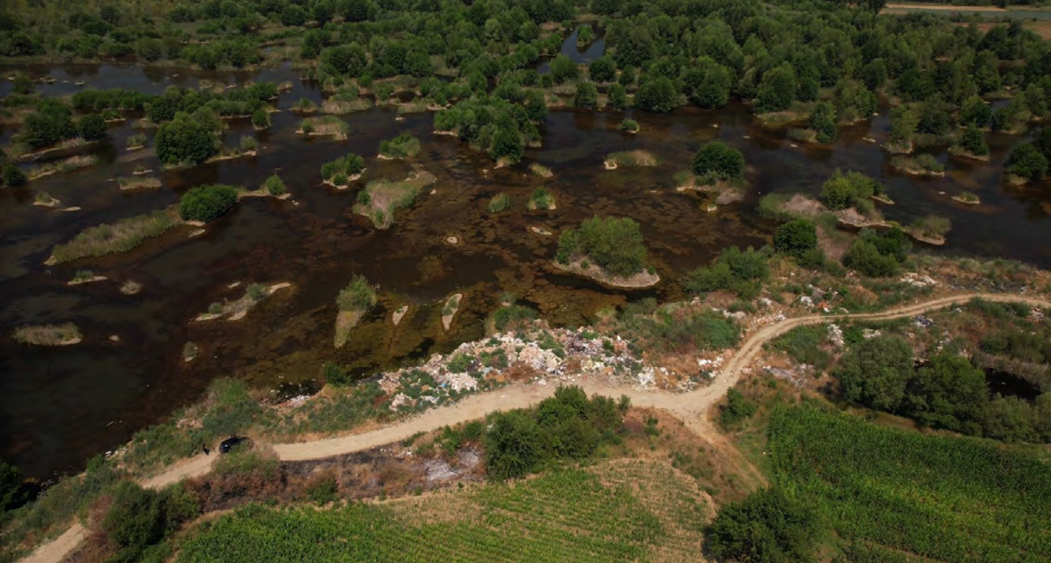
In addition to the degradation of the riverbed, an illegal landfill created along the White Drin in the village of Çifllak, Rahovec.