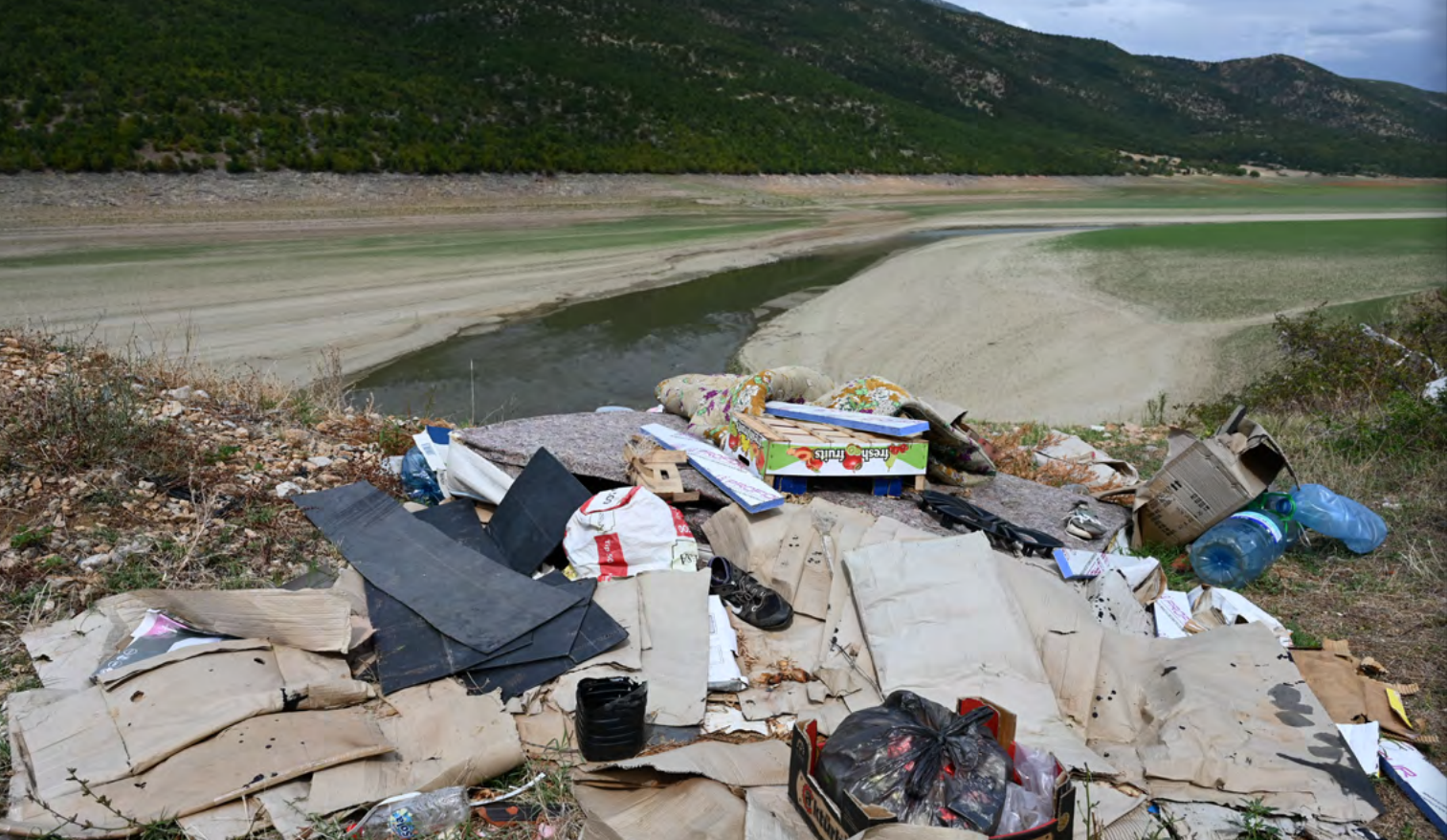
Plastic waste carried by the flow of the White Drin towards Albanian territory at the Morina border.