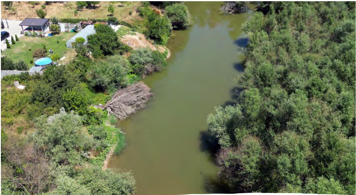
A few meters from the river, in the yard of a house in the village of Gjonaj, a plastic swimming pool can be seen, while the river is no longer used for recreation.

“Usually, waste is more visible in spring due to the rains that start at that time. During the winter, the Drin is cleaner,” Pulaj explains.