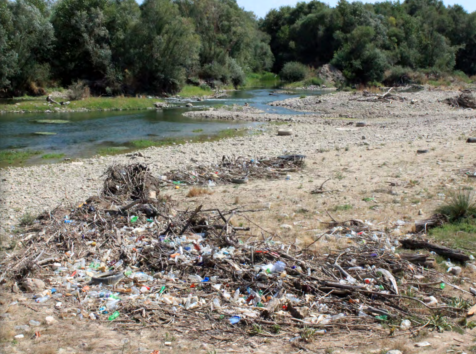
The condition of the White Drin in the village of Rakovinë, Gjakova.