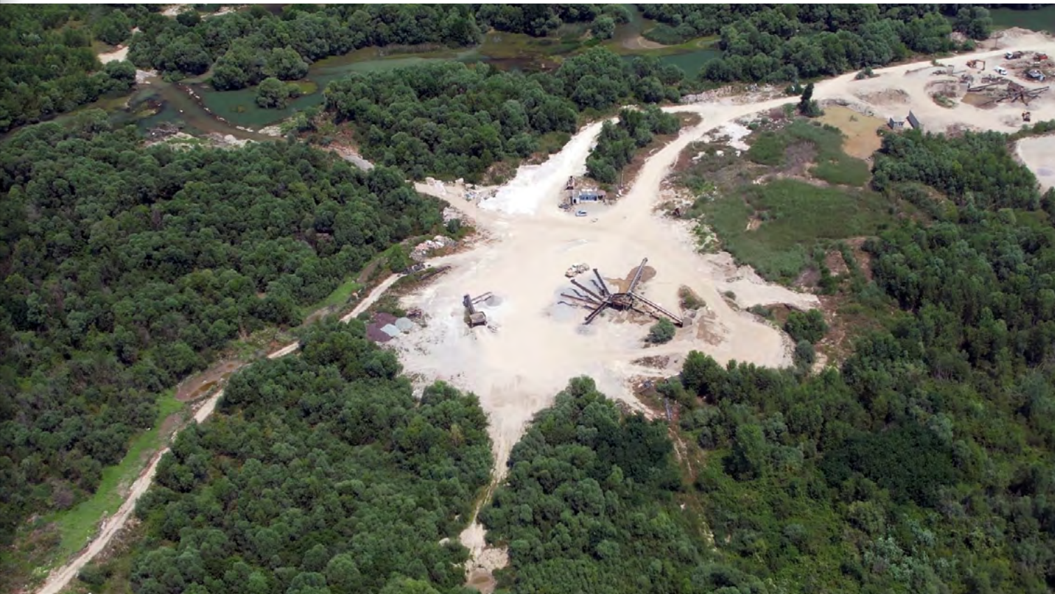
The village of Kramovik, through which the White Drin flows, is among the locations most degraded by sand and gravel extractors.