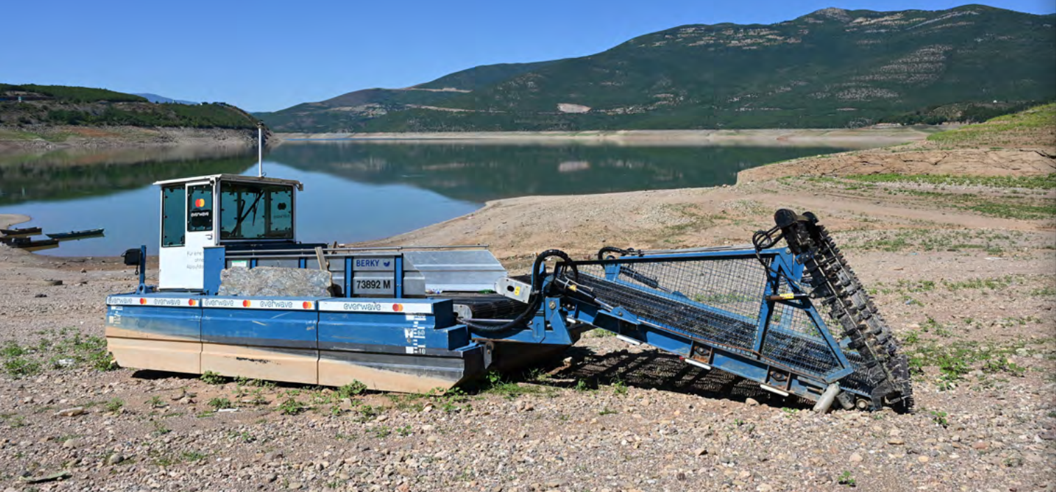
The boat that collects the lake's waste, which stays on the lake shore during the summer months.