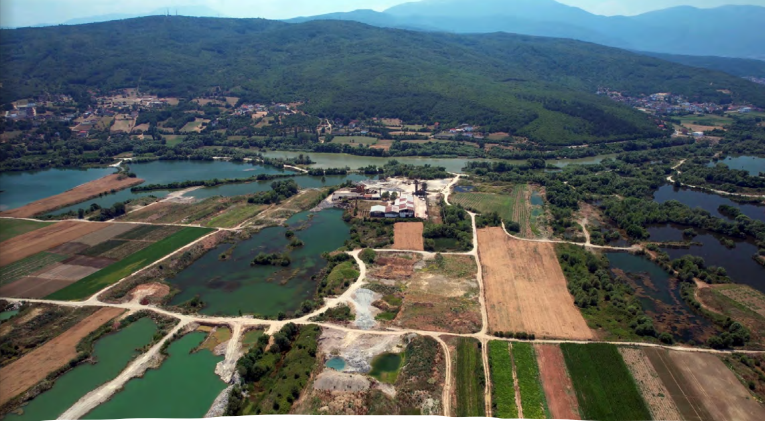
The degradation of the riverbed of the White Drin in the village of Krushë e Madhe, Rahovec.

After visiting Gjonaj, we explored several other locations. Between the villages of Lukinë and Romajë, there is a stream that, just a few meters before joining the White Drin, is blocked by large amounts of waste, including inert materials. Some of this waste is occasionally set on fire after being dumped. A little further along, there is a sewage pipe coming from the village of Romajë, emitting a strong odor that troubles nearby residents. At the beginning of Lukinë village, next to the river, there is a large illegal dumping site, mostly containing inert waste.