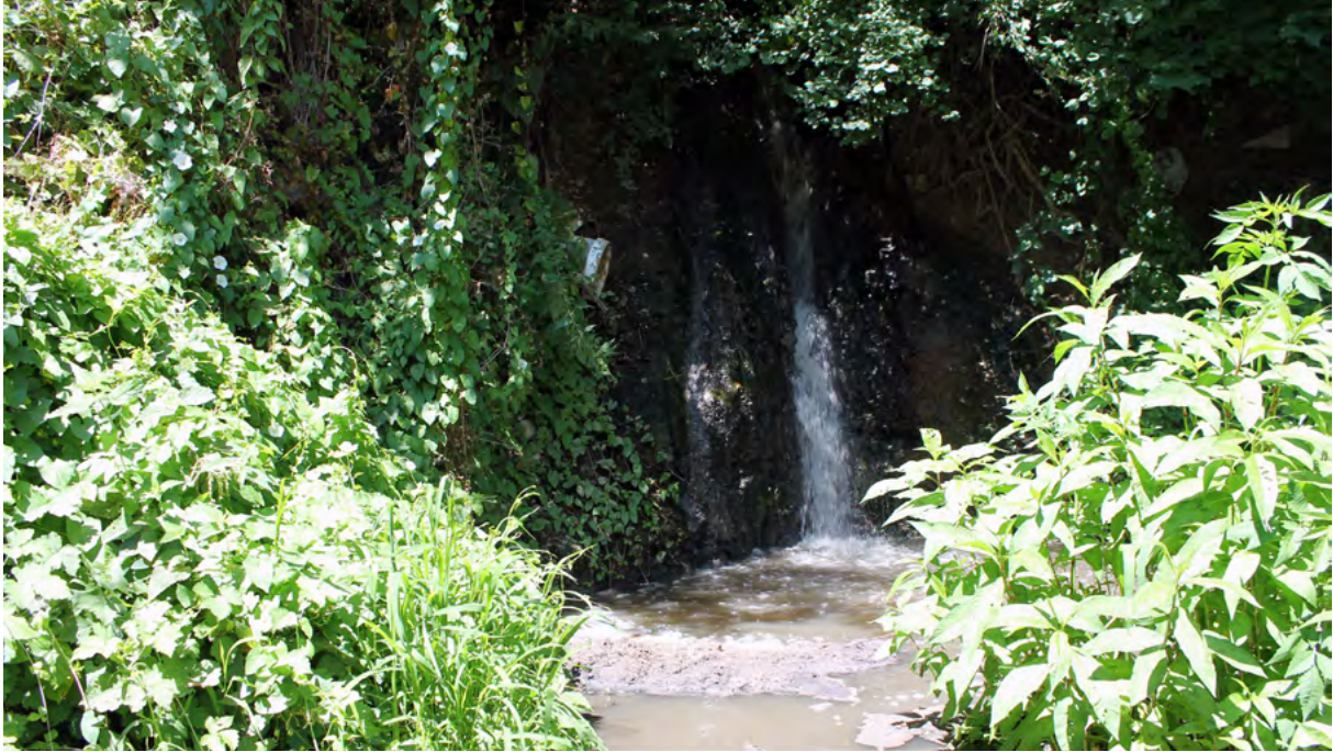
A large pipe discharges sewage and stormwater into the White Drin in the village of Gjonaj, Prizren.