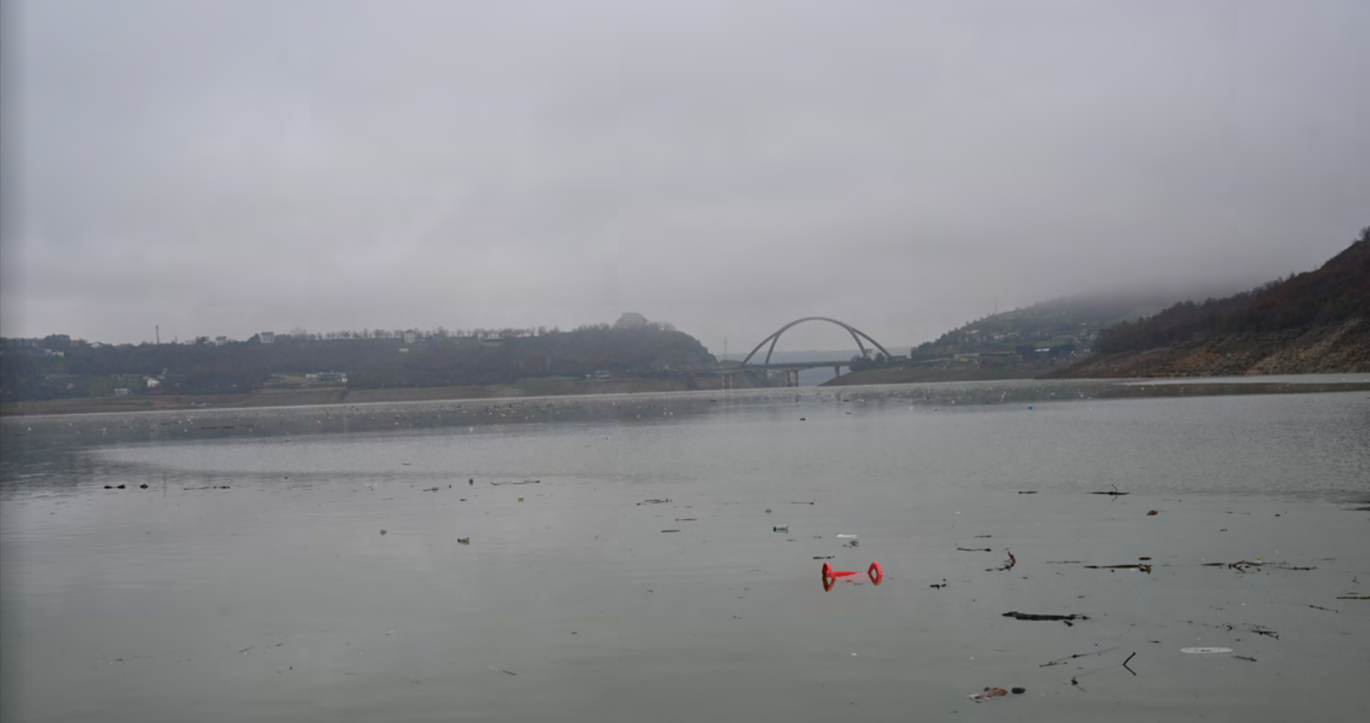
Waste floating across the entire surface of Fierza Lake in Kukës

“Creating barriers before these wastes enter Albania would be a good solution, ensuring that not only international conventions on transboundary waters are respected, but also bilateral agreements between the two countries,” Onuzi said.