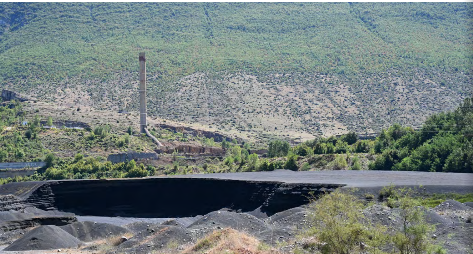
The inert materials from the former copper smelting plant in the lakebed.